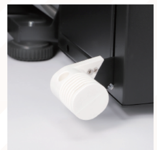
Easy Pinch Roller Lever