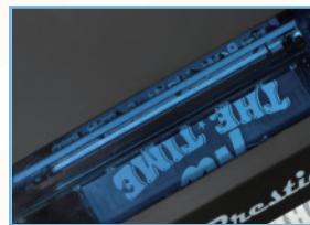
Window for printing quality checking