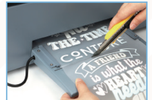
Security system for head protection