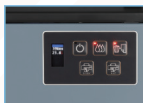
Easy to operate panel